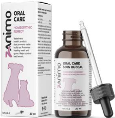
Available Size: 30 ml

For use in dogs and cats aged 2 months and older.